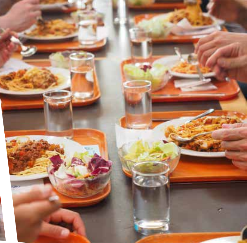
Exchange students are entitled to subsidised meals